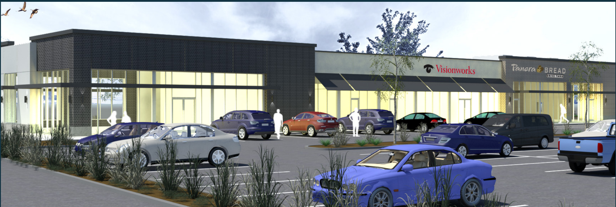
Willamette Town Center 831 LANCASTER DR NE, SALEM, OR 97301