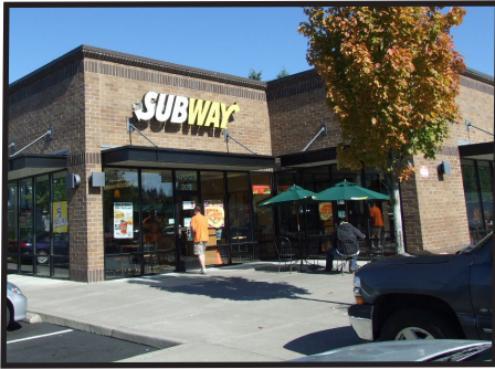
Salmon Creek Plaza is anchored by Safeway.

NE 129th Street & Highway 99, Vancouver, WA